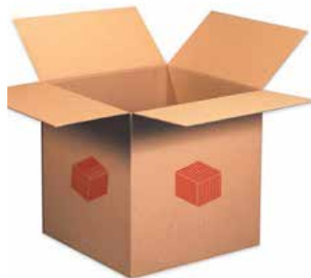
Corrugated Boxes Printed