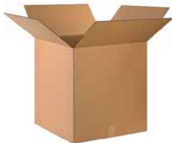
Corrugated Boxes Plain